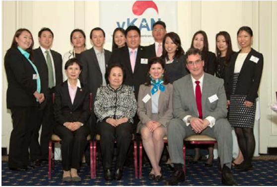
Last Princess of Korea