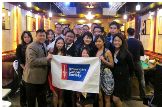
Joint Fundraiser for American Cancer Society