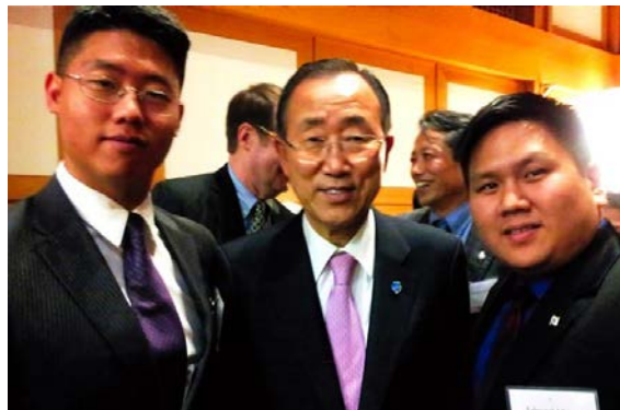
UN Secretary General Ban Ki Moon