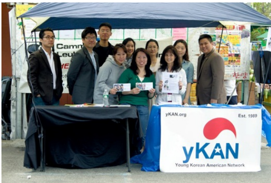
Leukemia Bone Marrow Registration Drive