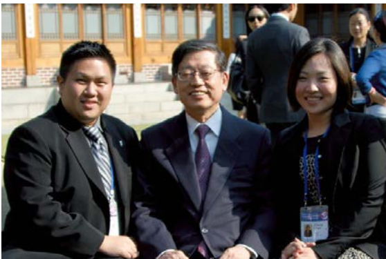
Korean Prime Minister Kim Hwang-sik